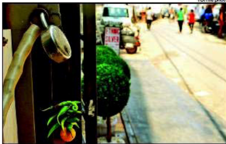
NOT THE SOLE OFFENDER: Several restaurants in the capital are flouting pollution norms, say trader associations